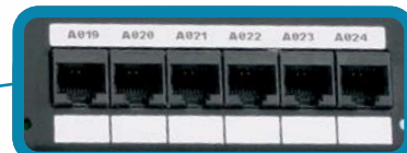
Patch Panel / Face Plate Labels