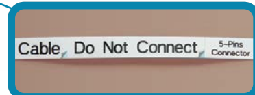
Mixed Length Labels