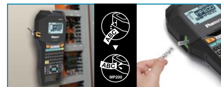
Printer attaches to metal surfaces with included magnet