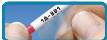
Continuous Self-Laminating Labels